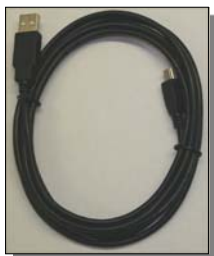
USB Cable (6ft/2m)