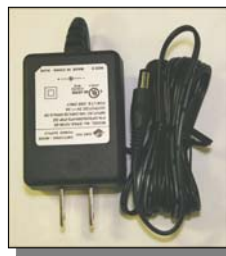
5V-2A Power Supply